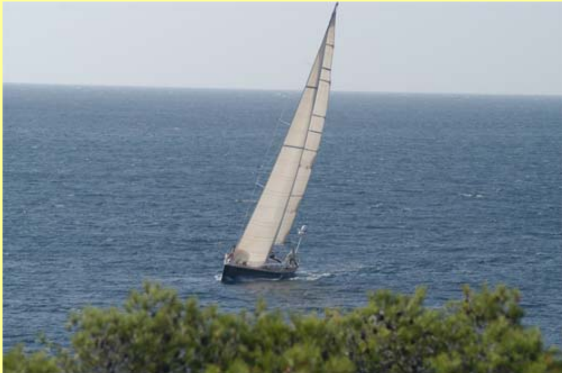
OTHER YACHTS INCLUDE GRAND SOLEIL 50 AND SUN ODYSSEY 54DS